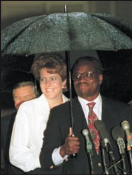
Clarence Thomas and Wife Virginia

Before 1967, laws would not allow Supreme Court Justice Clarence Thomas, a black man, to marry his wife Virginia, a white woman. Opponents of interracial marriage cited the Bible to justify this discrimination.